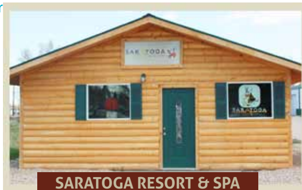
SARATOGA RESORT & SPA Sports Center

WE INVITE YOU! ALL GUESTS, MEMBERS AND PEOPLE IN OUR COMMUNITY FROM BEGINNERS TO ADVANCED. COME EXPERIENCE FUN EVERY WINTER DAY WITH US.