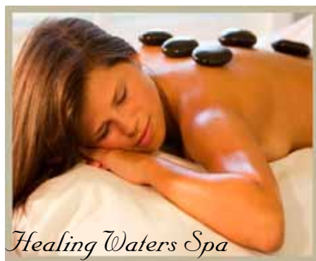
Healing Waters Spa